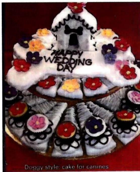
Doggy style: cake for canines